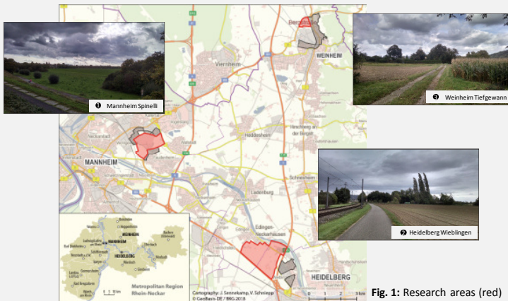
Fig. 1: Research areas (red)

In a pilot study, all conflicts were empirically addressed for selected green and open spaces in Mannheim, Heidelberg and Weinheim by: